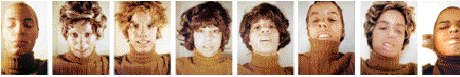
Untitled (Facial Cosmetic Variations), 1972 35 mm color slides

This exhibition examines the brief yet prolific career of Ana Mendieta and traces her development from early performances of the 1970s to sculpture and objects from the early 1980s made of fragile, earthen materials. Born in Havana, Cuba in 1948, Mendieta came to the United States, in 1961, without her parents. She and her elder sister joined fourteen thousand Cuban children whose exile from Fidel Castro's Communist revolution in Cuba was aided by the United States Catholic Church. Placed in foster care in Iowa, the Mendieta sisters would not see their parents again for many years. Mendieta's personal and professional development was greatly informed by the painful experience of exile as well as the intersection of Caribbean and North American cultures. The artist later commented: